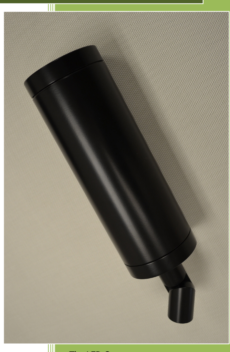
The LED Company 17795 Sky Park Circle, Suite A. Irvine, CA 92614